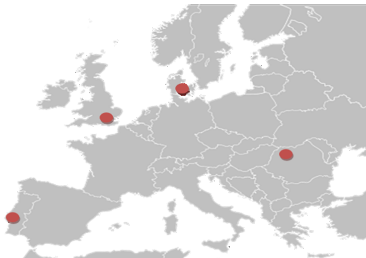
Figure 1 CATCH Core Interest Group cities

The four cities chosen from the applications were: Baia Mare (Romania), Lisbon (Portugal), the London Borough of Hounslow (UK), and Odense (Denmark). A fifth city, Rotterdam, was also originally a member of this group, but was forced to pull out due to budgetary problems, following a change of government in the city.