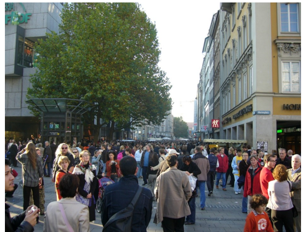
More pedestrian traffic can positively affect retailers.

Better accessibility by public transport (light rail or bus rapid systems) has also shown positive impacts on (residential and office) property values 4 . For less developed or deprived urban areas, this can mean a significant push for investments from private stakeholders in order to improve the neighbourhoods.